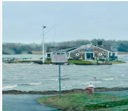
Orleans Yacht Club post storm surge 2024

Organized By: Orleans Marine and Fresh Water Quality Committee