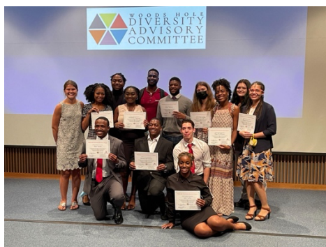
2021 PEP Cohort

The PEP staff will visit campuses (both in-person and virtually) to meet potential applicants in December through February. They are available now via Zoom video conference to answer questions and to talk with interested groups of students and/or faculty. To make an appointment, contact the PEP Coordinator at: WHPEPCoordinator@gmail.com .