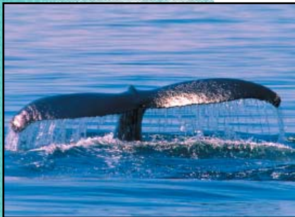
Learn about recent whale behavior research missions