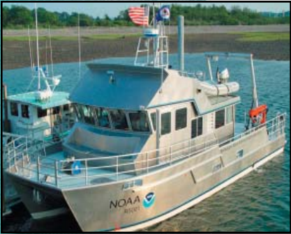
View the sanctuary's new state-of-the-art Research Vessel AUK